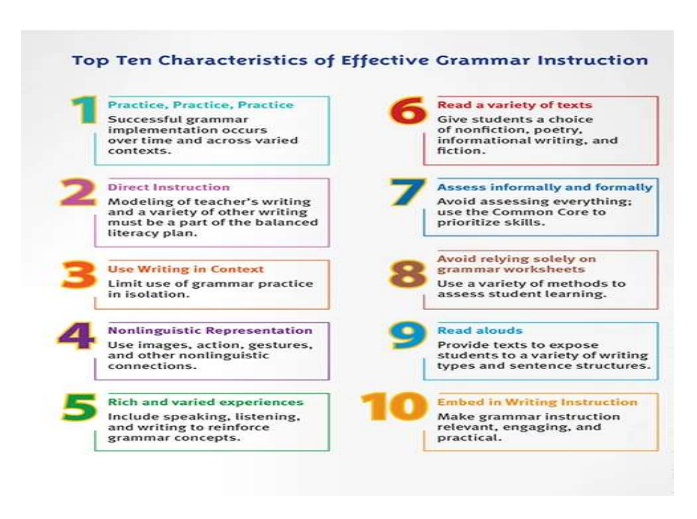
Figure 2: Top 10 Characteristics of Effective Grammar Instruction